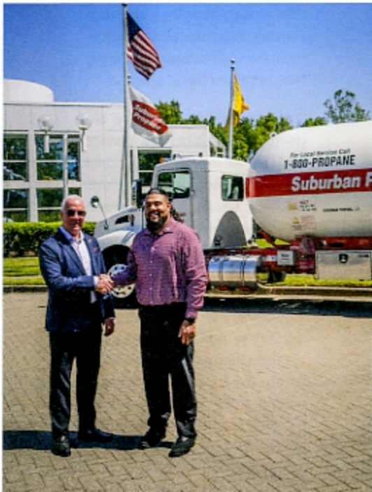
Suburban Propane was named a distinguished employer within the Nevada Department of Veterans' Services Patriot Employer Program.