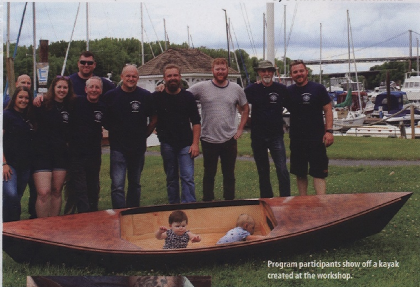
Program participants show off a kayak created at the workshop.