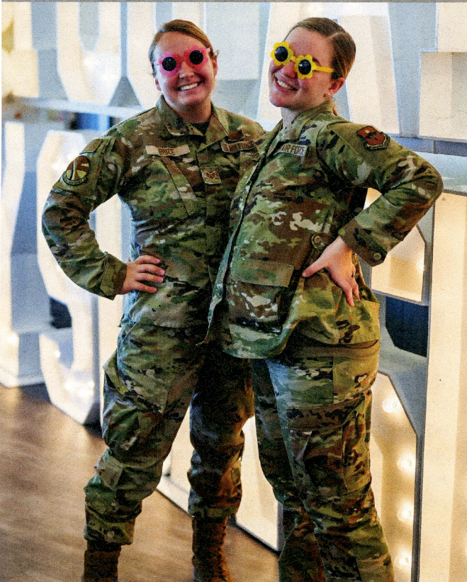
Above: Expectant families pose for a shot during a group baby shower Left: Expectant active-duty moms showing their baby bumps

and show appreciation for military moms and moms-to-be," she continues. "We continuously strive to reach that goal by engaging with these constituents as a team to create fun and memorable baby showers."